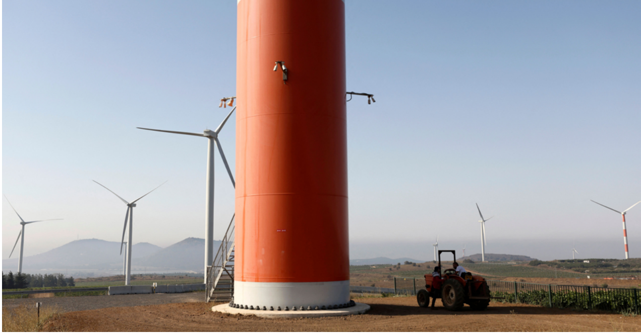
Wind turbines operate in a wind farm in Golan Heights.