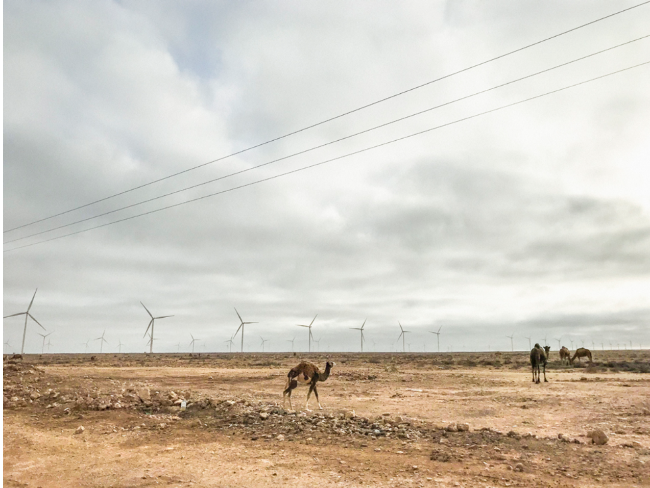
Wind turbines in the Western Sahara. Photo by Giovanni Mereghetti/UCG/Universal Images Group via Getty Images.

2. Semi-commercial business model – this offers significant benefits for local communities. Electricity revenues allow VE to cover O&M costs, invest in scaling up, re-pay debt, and provide free electricity to local clinics and schools and for public street lighting.