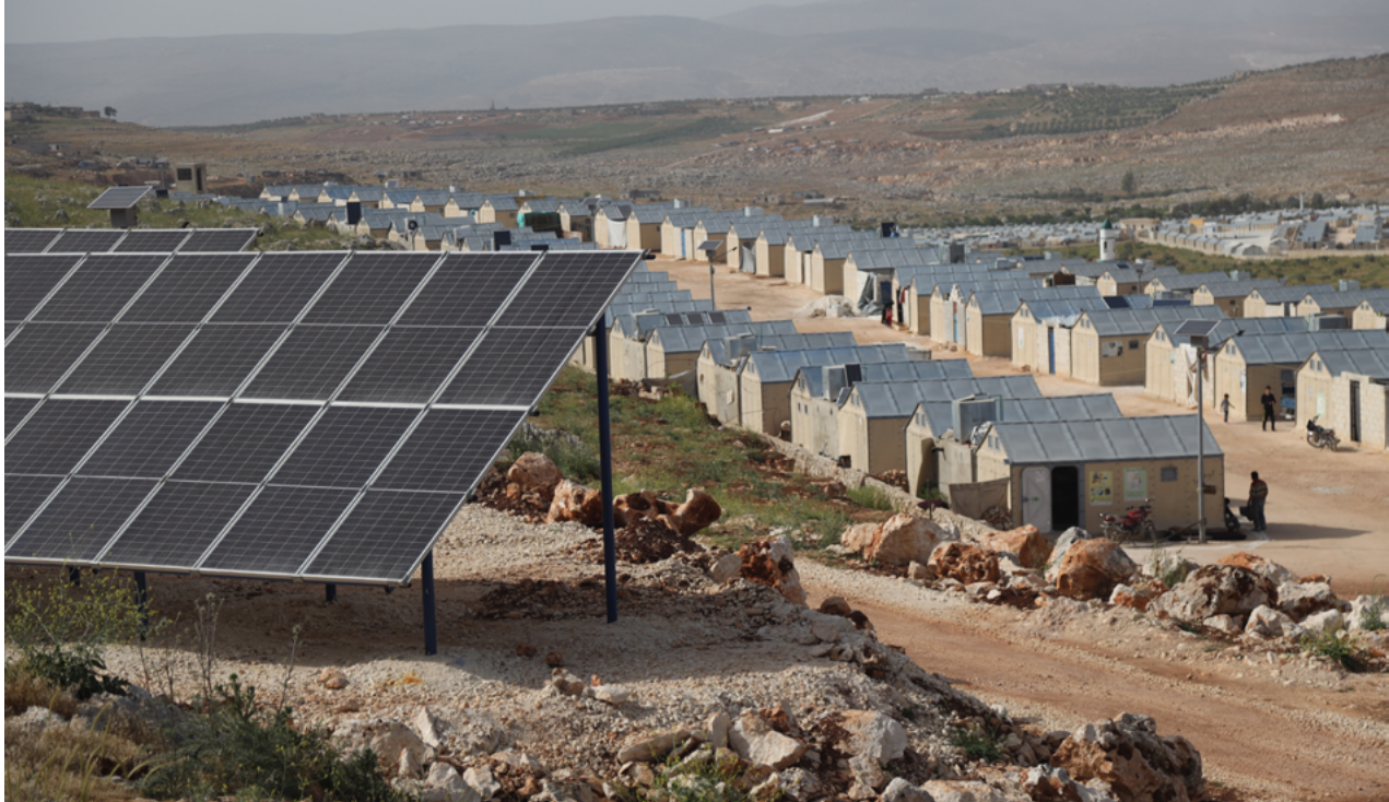
Ras as Sinn, Syria. Solar panels of the solar power plant in the Kafr Gals camp of Maram.

requirements for conflict sensitive approaches (either from government regulations or as conditions of funding from donors or investors). However, as growing stakeholder demands for corporate responsiveness on ESG issues spurs an expansion of global regulatory frameworks, investors and project developers are facing increased pressure to better understand, assess, and report on ESG aspects of their investments in FCAS, including how these issues dovetail.